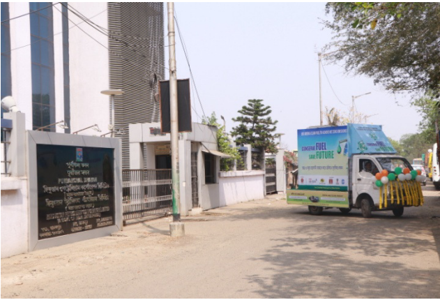
In front of HPCL Office, Kolkata