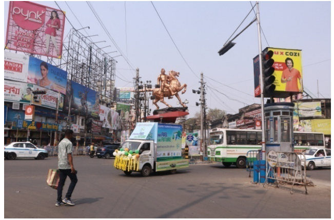
Shyambazar 5 Point Crossing