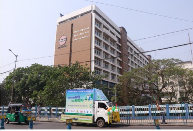
In front of Indian Oil Office, Kolkata