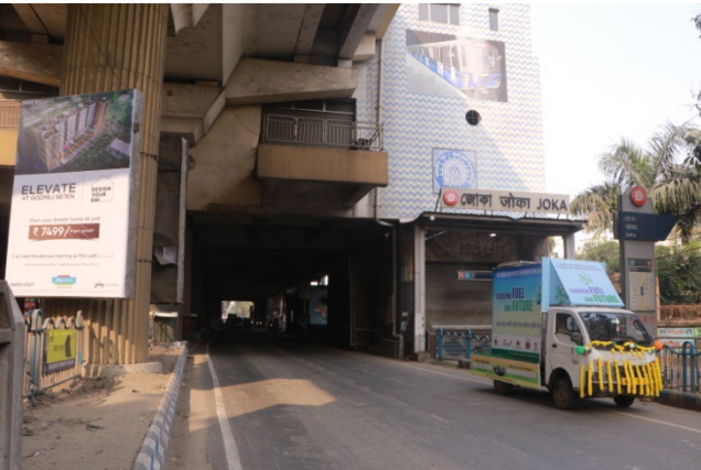
Joka Metro Station