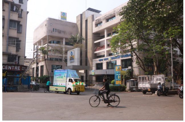
In front of BPCL Office, Kolkata