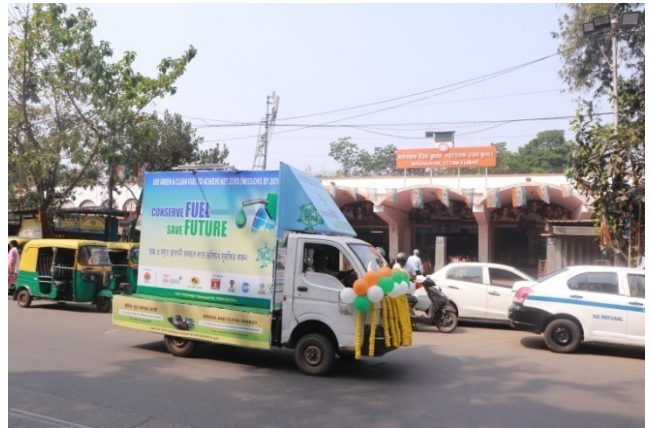
Tollygunge Metro Station