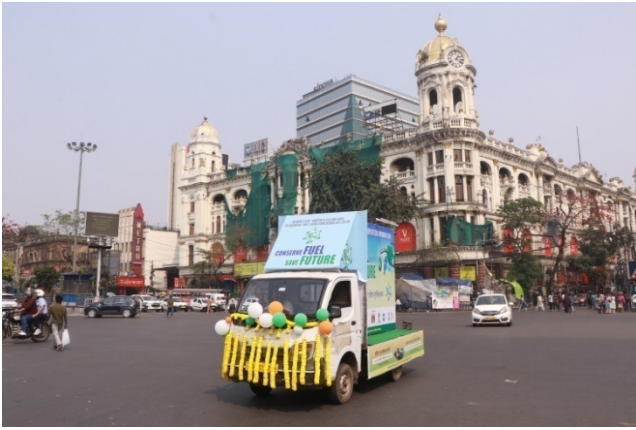
Chowringhee / Dharmatala