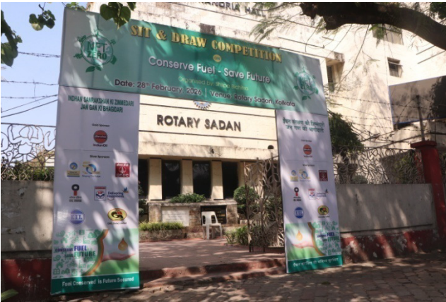
Main Entrance of the Rotary Sadan, Kolkata