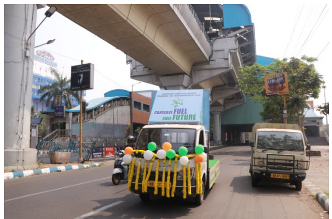
Karunamoyee More, Salt Lake