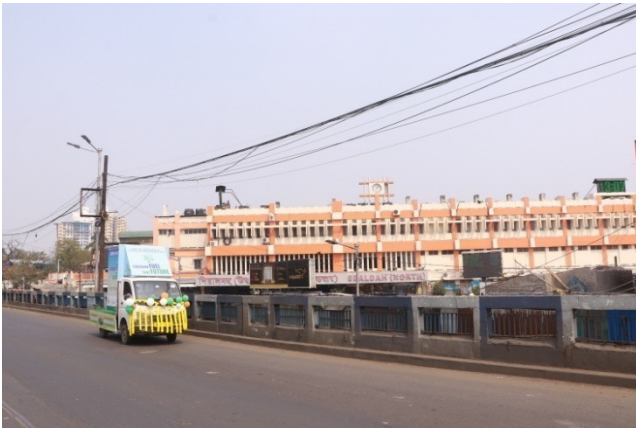
Sealdah Station Flyover