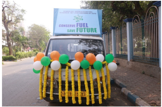
Campaign Van beside Rabindra Sarobar Lake