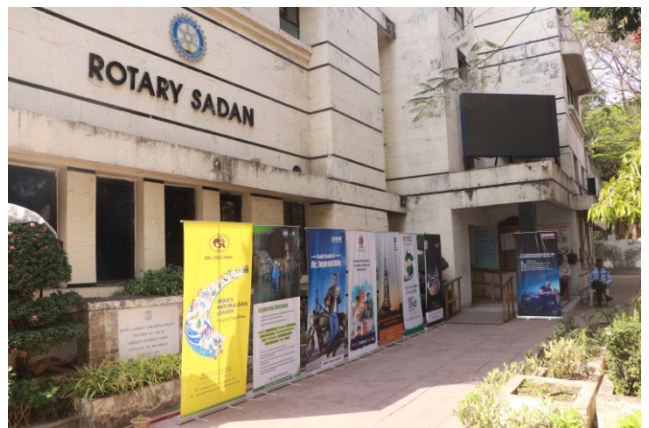
Entrance of the 'Rotary Sadan Auditorium'